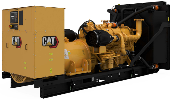
Image shown may not reflect actual configuration