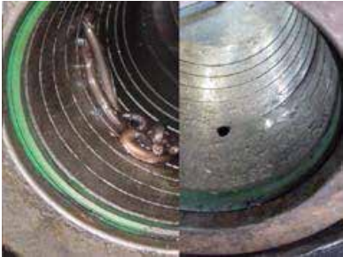
Cat® Hydraulic Hammer Paste provides a layer of protection between the tool and guide bushings.

Hydraulic hammers and other tools experience extreme conditions that can lead to rapid wear of guide bushings. Cat® Hydraulic Hammer Paste is formulated 1 to cling to parts even under conditions of high shock, extreme pressure, high temperature and extreme wet conditions.